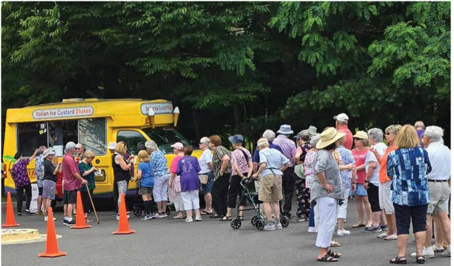
JRLW Ice Cream Social