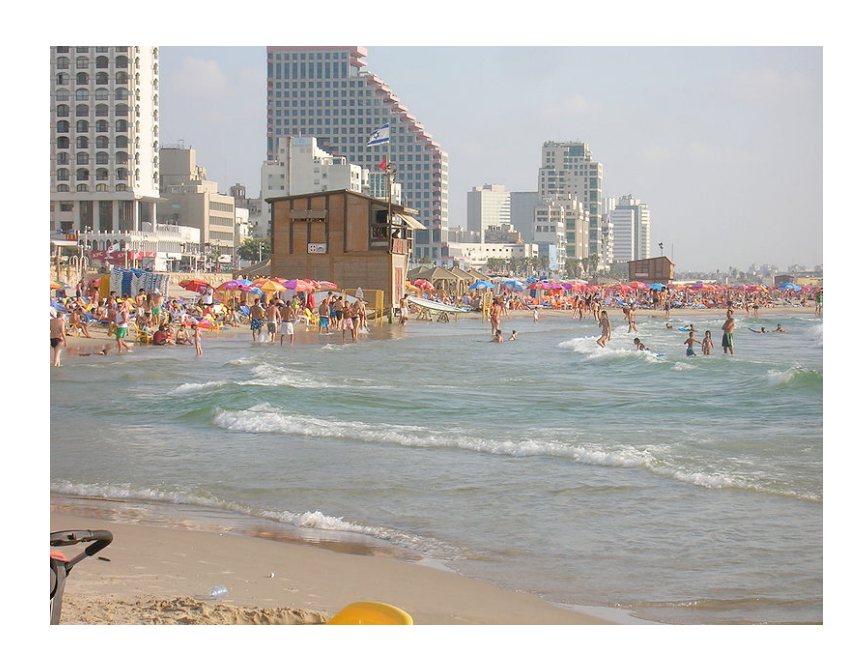
The Beach in Tel Aviv