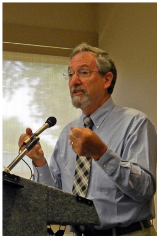
Rabbi Lecturing on “3 Faces of Judaism”

Specializing In Helping Seniors & The Health Impaired To Help Themselves