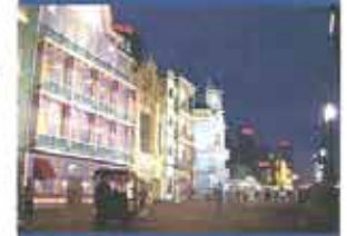
Enjoy the world-famous Boardwalk.