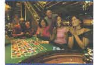
World-class gaming in Atlantic City awaits!

Diamond Tours inc. Bringing Group Travel to a Higher Standard®