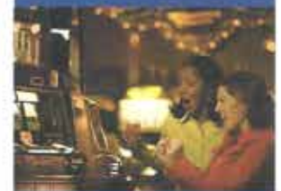
Give Lady Luck a Spin!