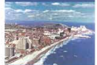
The spectacular Atlantic Ocean Shore.