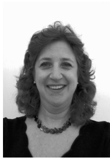
By Beth Shapiro JSSA Senior Services

If you or someone you care about has been feeling down for weeks, gaining or losing weight, struggling to concentrate and perhaps growing uninterested in once enjoyable activities, the cause may be depression. Depression is more than just temporary sadness or the blues. It is a serious, yet medically treatable illness. By understanding depression, its symptoms and its treatments, you can take important steps toward protecting your health.