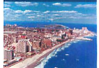
The spectacular Atlantic Ocean Shore.