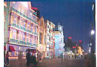
Enjoy the world-famous Boardwalk.