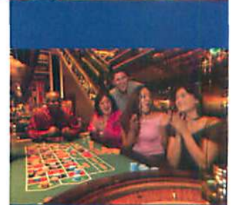
World-class gaming in Atlantic City awaits!

Diamond Tours ® inc. Bringing Group Travel to a Higher Standard®