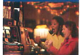
Give Lady Luck a Spin!