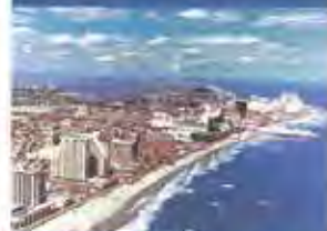
The spectacular Atlantic Ocean Shore.