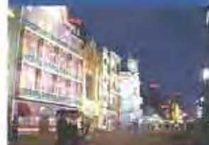
Enjoy the world-famous Boardwalk.