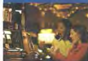
Give Lady Luck a Spin!