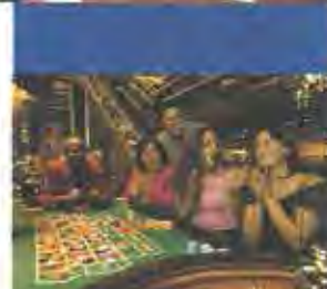
World-class gaming in Atlantic City awaits!

Diamond Tours inc. Bringing Group Travel to a Higher Standard®